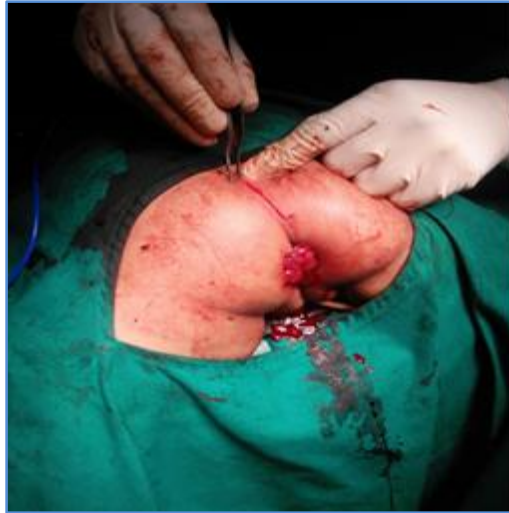
Fig. 3: Intraoperative photograph showing creation of a new anal opening and the completion of PSARP

DISCUSSION: In developed countries, delayed presentation of uncorrected ARM is an uncommon event because of routine neonatal examination before discharge from hospitals. In developing countries like India, a large number of births are home deliveries, assisted by untrained or non-medical persons. [4] Therefore, ARMs may be missed at birth and initial presentation may be during infancy or even later in childhood, especially if there is no acute intestinal obstruction or associated congenital malformations.