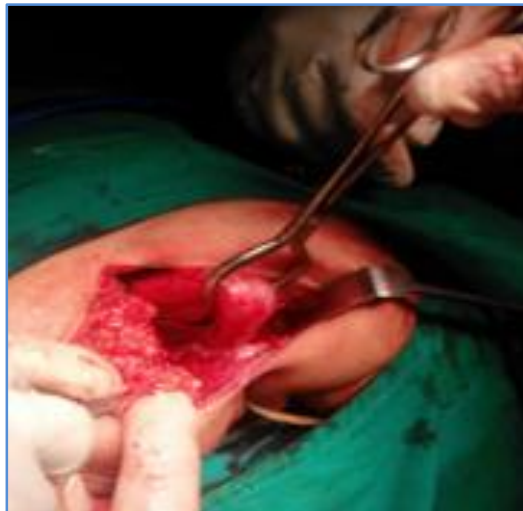
Fig. 2: Intra-operative photograph showing a large recto-vaginal fistula during PSARP

The post-operative period after the first stage procedure was uneventful. Patient was discharged after the 7 th post-operative day. The parents were advised to report after twelve weeks for the second stage procedure but they reported only sixth months later. Since there was a good bowel decompression through the stoma, the second stage posterior sagittal anorectoplasty (PSARP) was performed. Intra-operatively, a large recto-vaginal fistula was found as shown in Fig. 2. Fig. 3 shows the creation of a new anal opening and the completion of PSARP. The post-operative period was uneventful. Two weeks after PSARP, the baby was started on an anal dilatation regime. The same was taught to both the parents so that they continue doing that at home on discharge. The patient was then discharged on the 10 th post-operative day. Six weeks after PSARP, the stoma was closed. All the surgical procedures were uneventful and at present the patient is doing well and is on regular follow-up.